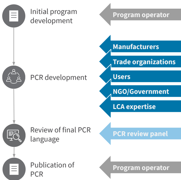
Figure 2. Process and stakeholders for PCR development (adapted from process outlined by ISO 14025:2006 ).

Similar to other industry standards, the development of PCRs is an open stakeholder development process . This means that interested stakeholders, including industry and trade associations, review the draft PCR and provide feedback throughout its development.